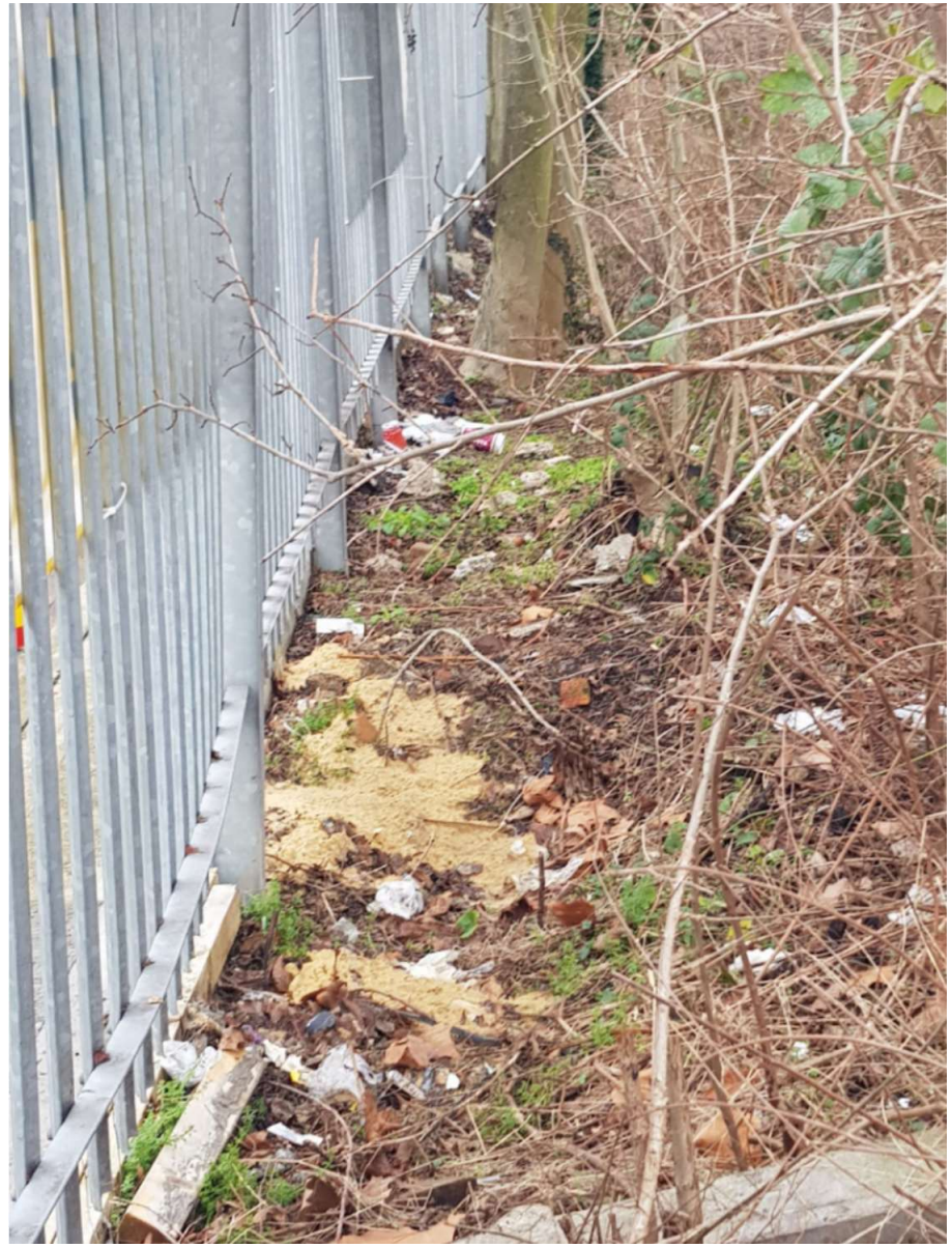
Litter and waste coming from Shell in White Hart Roundabout

Following a significant amount of work by LAGER Can beginning during the pandemic in 2020, the Shell Station at the White Hart Roundabout was served with a Community Protection Warning (CPW) to remove the plastic gloves from the outdoor space, to prevent waste from their land escaping onto the surrounding land, and to litter pick the surrounding land periodically. This was upgraded to a Community Protection Notice (CPN) in November 2022. We have received notice that Shell are challenging the CPN in court, and that case is now with our legal team to assist with.