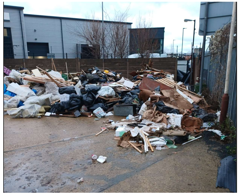
Waste left from unauthorized encampment in Acton

Street Services have evicted 5 unauthorized encampments including a group that used a 4x4 to move the concrete barrier in front of the gate and cut the lock to gain access to the former Acton Recycling Centre on Stirling Road. The group there fly tipped more than 15 caged vehicles worth of builders' material including approximately a dozen black sacks of