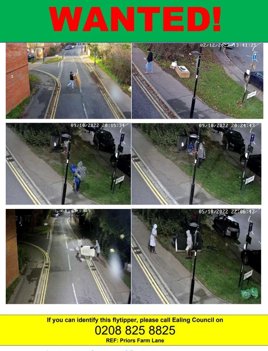
Posters created using CCTV footage of fly tipping