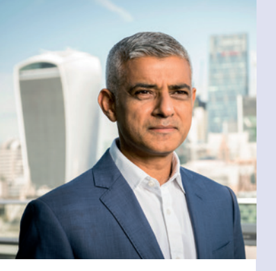
Sadiq Khan Mayor of London

Toxic air pollution is a matter of life and death, with thousands of Londoners dying prematurely each year, children growing up with stunted lungs and a higher risk of dementia in older people. More than 500,000 Londoners live with asthma and are more vulnerable to the impacts of toxic air, with over half of these people living in outer London boroughs. That is why I'm determined to take action to protect the health of Londoners and help tackle the climate emergency.