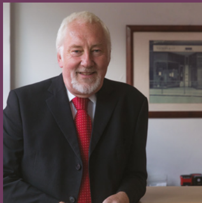
Stephen Ingall Vickers & Co